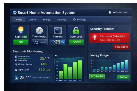
Figure: Home page